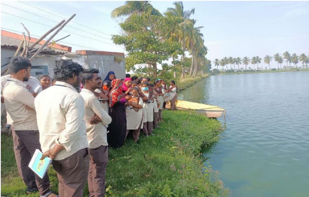
Students observing prawn pond at Arugolanu