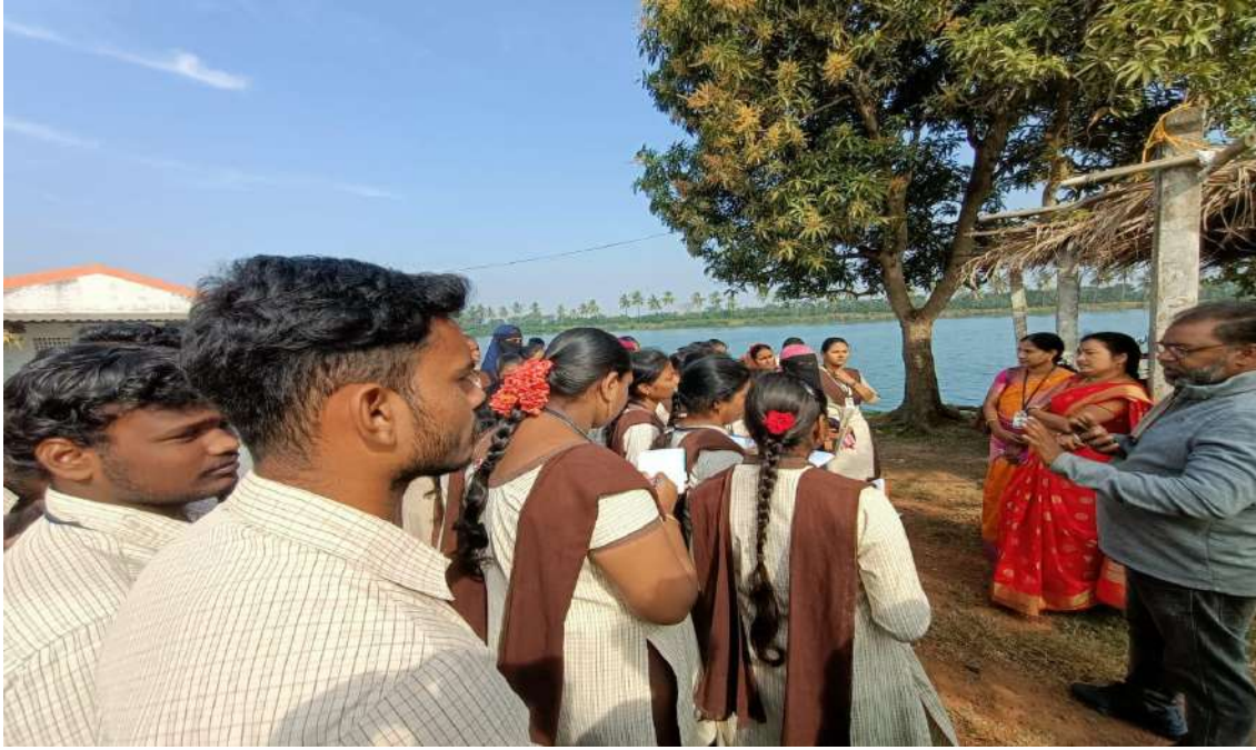
Students at Arugolanu Fish Farms for Internship Program